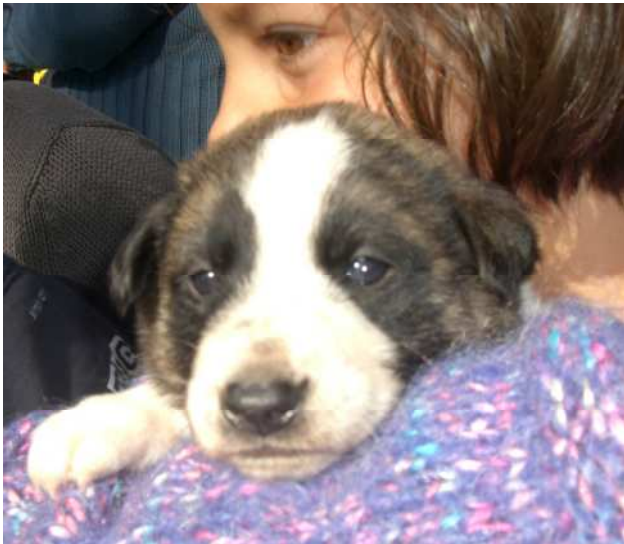
This is Little Whiskers; he went to live with someone else. He is so cute.