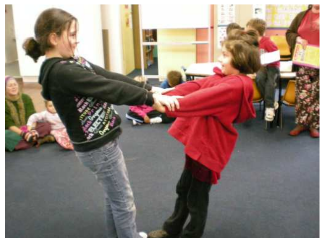
This is me and Cait, spinning around. It is fun spinning around, leaning back and holding onto someone's hands. Sometimes I just spin around until I fall over.