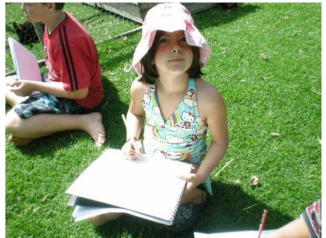
At camp we went to The Great Escape and we saw the animals. I went on every single slide on my own. It was fun.