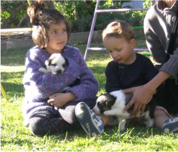
This is me. I am holding my dog. I am showing her for pet week. Her name is Mishie. She is big and fluffy and she likes to run around the house a lot and wake us up in the mornings.