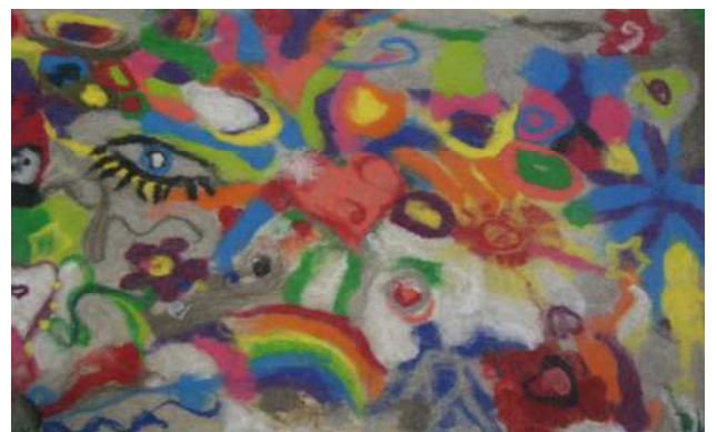
Options Day was really fun because we got to make cookies and do felt work and make angels. I helped to make this felt picture.