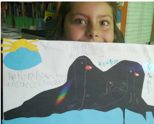
We went to Bibra Lake and learnt about swans.