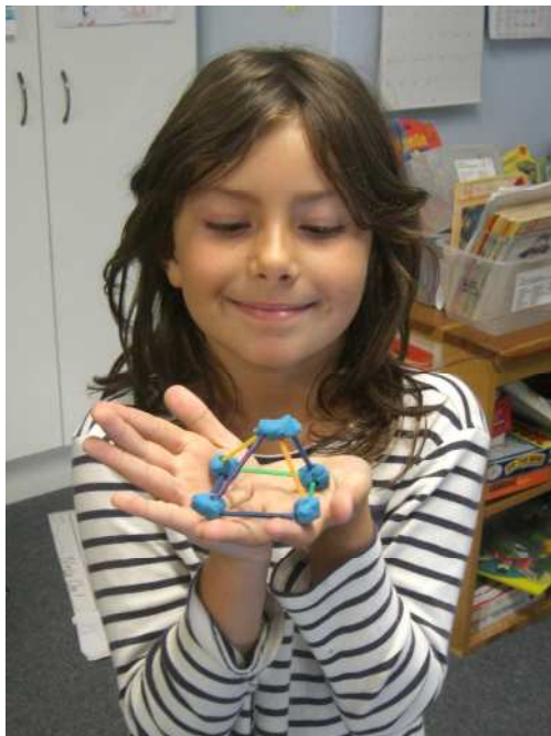
This is me. I am holding my sculpture of a pyramid. I made it by play dough and sticks, little tiny sticks.