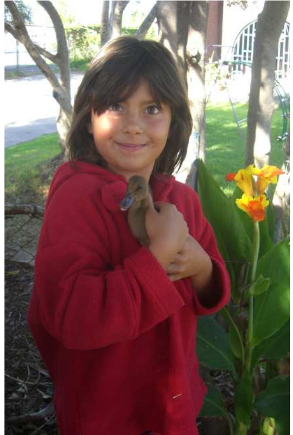
This is me holding Zelda's duckling.