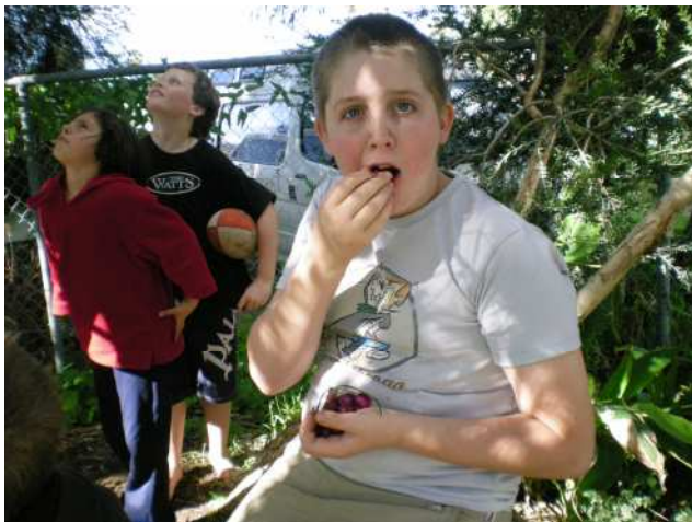
Lilypilis are a nice fruity thing that I discovered at this school. Sometimes they're hard to get to.