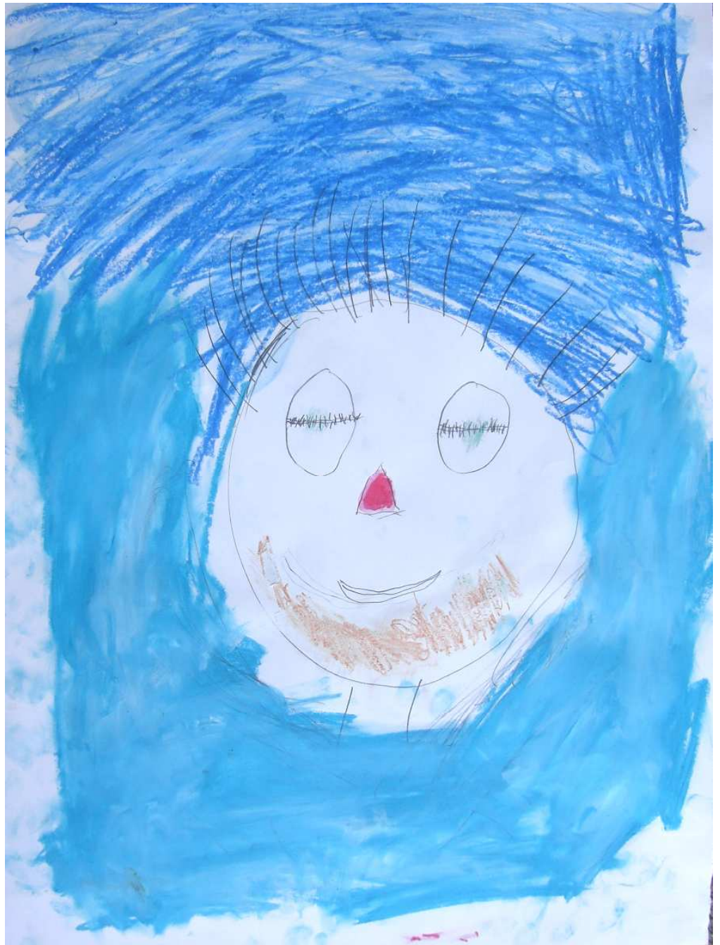
This is a picture of going through the tunnel at The Great Escape. I went to The Great Escape on my first camp at Kerry Street. It was really good!

This is me trying to get a good smile shot... stick man can do it, why can't I?