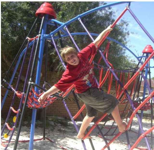
This is a shot of me playing on the school playground.