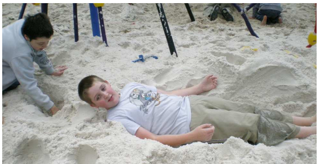
This is Willow trying to bury me alive.