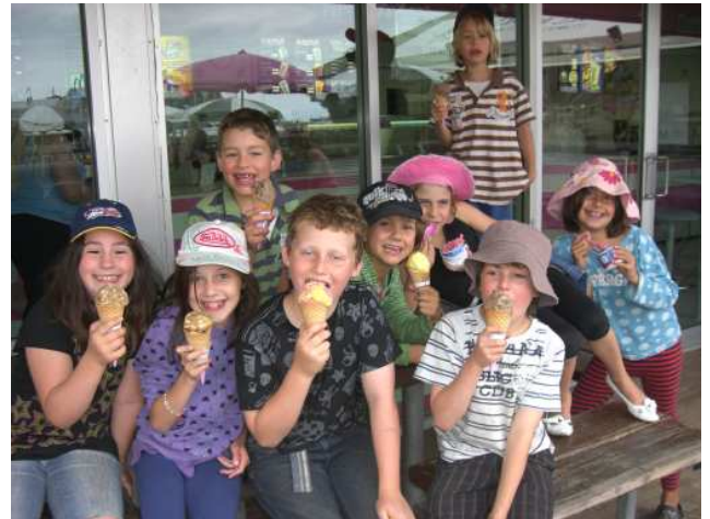
Yummmmm. My flavour was low fat coffee and cream. I repeat, yummmmm.