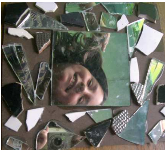
This is my ungrouted mosaic.