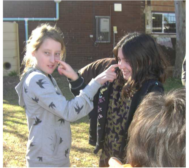
One morning we played a game. There was someone out the front and they would call out a body part and you would have to put your finger wherever they said.