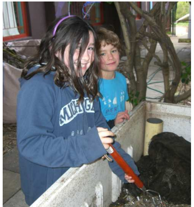
For one of my pack up jobs, I was worm farm person. You have to blend old food scraps and shred paper for the worms to eat. You have to spray water and collect the worm wiz. Worm wiz is especially good as a natural fertilizer.