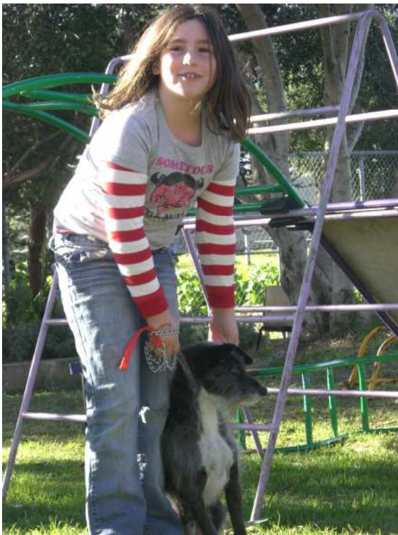
I like to spend time with Bingo, my dog. I am not strangling Bingo, don't worry.