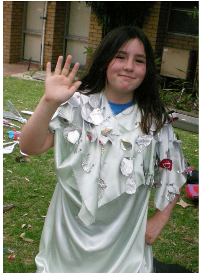
I was a water drop at the Fremantle Festival Parade and a tourist came up and took my picture. Kerry Street is a Waterwise school.