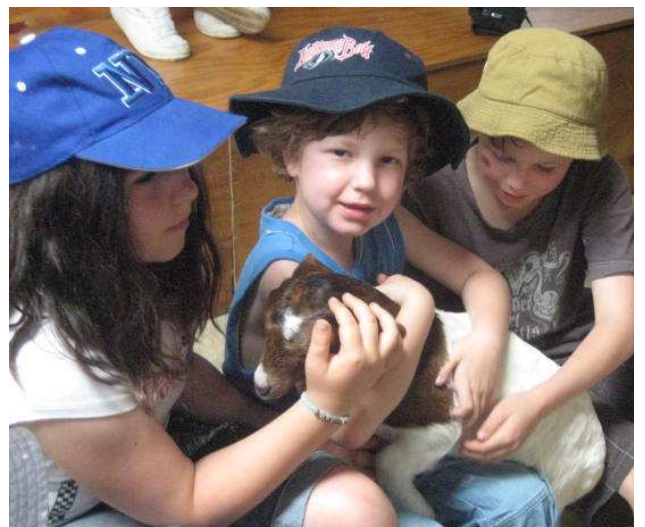
Landsdale Farm was fun apart from getting sick and it was so hot. I didn't get to go to The Great Escape.