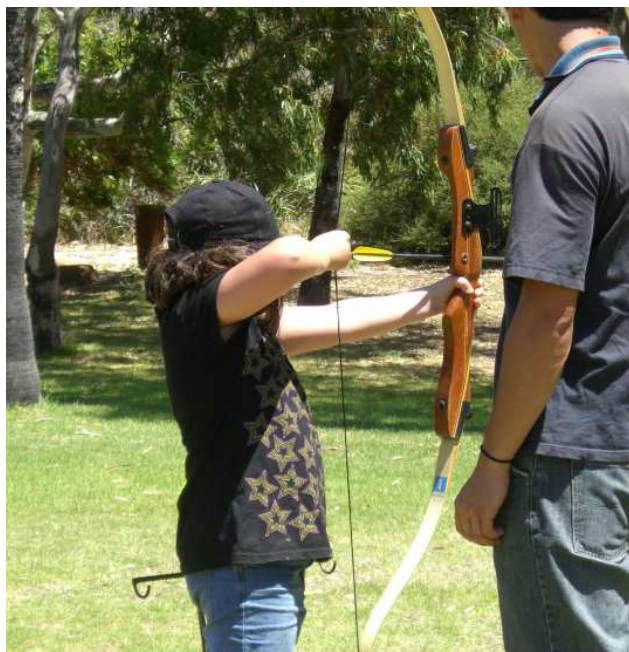
It was so hot at the Hillaries camp. We went on a flying fox and did archery. We went to the beach and the best thing was The Great Escape.